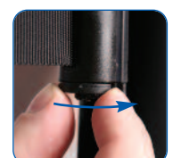
Each unit is fitted with anti-tamper tape ends