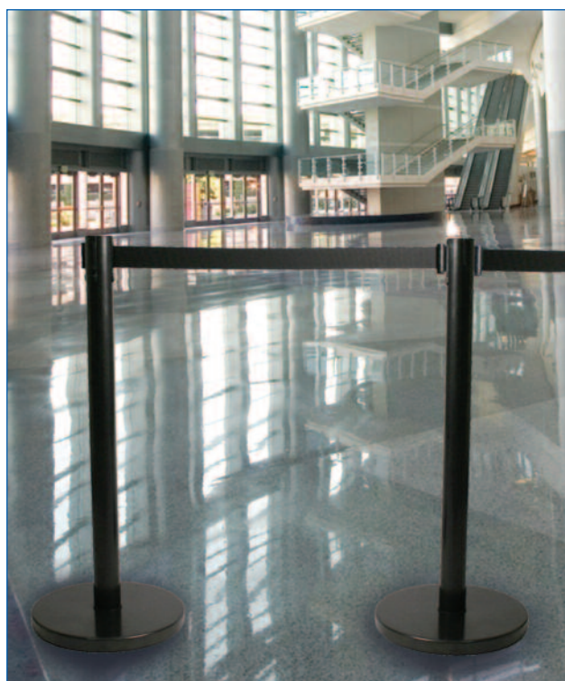
Leader Plus Code LB800 (sold singularly - 1 base, pole and 1 length of webbing)

Leader Plus is a smart retractable barrier system, ideal for use in retail outlets, airports, entertainment venues, reception areas or any location where queue control is required.