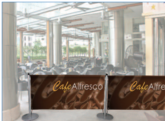
(Graphics not included)

1000mm Rope Code LB908 1500mm Rope Code LB907