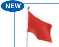
NEW Wind Dancer Lanyard Conversion Kit UB715-C The Wind Dancer Conversion Kit allows you to attach a custom flag (see below) onto a Wind Dancer, converting it into a flagpole.