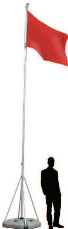
NEW Wind Dancer 7.4m UB712-C (shown with optional Lanyard Kit)