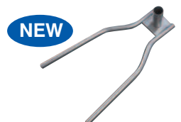
NEW Drive-on Car Foot UB721-C