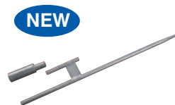
NEW Ground Stake UB720-C