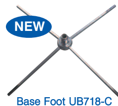
NEW Base Foot UB718-C