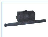
NEW Bags for Wind Dancer UB716-C