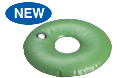
NEW Weighting Ring UB719-C