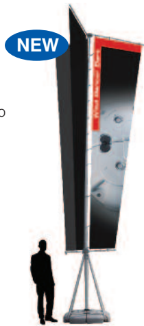
NEW Wind Dancer Dart Conversion Kit UB713-C (indoor only)