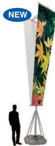
NEW Wind Dancer Spire Conversion Kit UB714-C (indoor only)