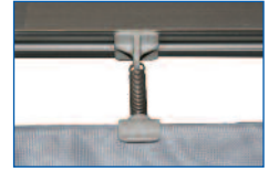
Spring Clip (Graphic Option D)

NB - Fixings not included with kit for any of the graphic options shown