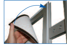
Mag Tape / Steel Tape (Graphic Option C)