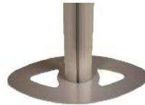
All kits use 5mm thick steel base (unless otherwise stated)