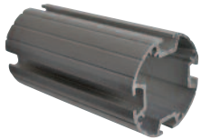
75mm (dia) Round Post Option A

NB - Fixings not included with kit for any of the graphic options shown