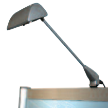
Powerspot 1000 Available in black and silver