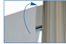
Looped Fabric Fixing (Graphic Option A)

We have created a range of standard display kits for you to choose from, to satisfy a range of display applications.