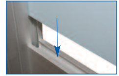
Rigid Substrate Infill (Graphic Option B)